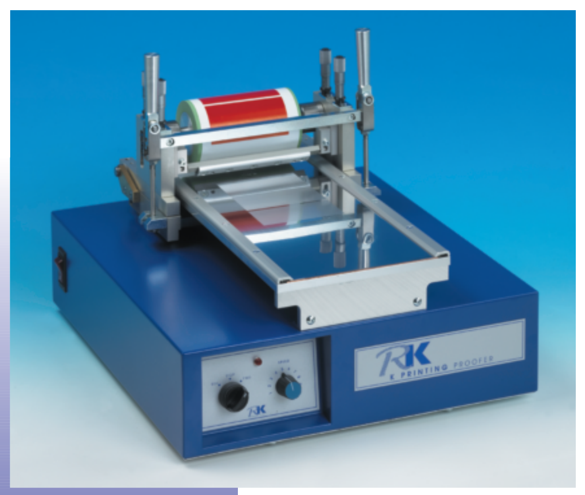
Above: K Printing Proofer Gravure Below: Detail of the K Printing Proofer